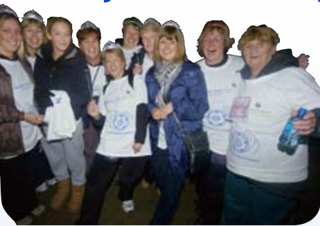
Chalks Away Northstead School Team