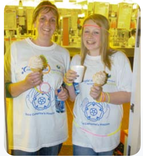
Harbour Bar Refreshing ice creams & warming drinks

On arrival back at Saint Catherine's medals were awarded and more tea and coffee was on offer!