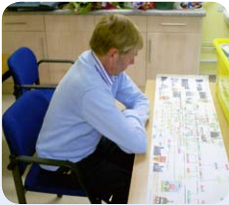
Peter Walker Day Hospice patient studying his family history